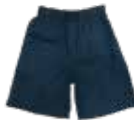
Navy Elastic Waist Shorts