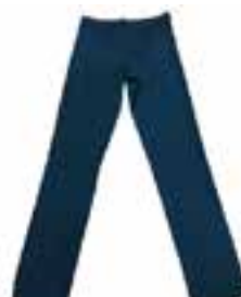
Girls Navy Straight Leg Pants