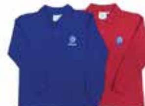
Long-sleeved Polo Shirt