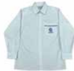
White Shirt Long/Short Sleeved