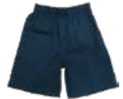
Navy Elastic Waist Shorts