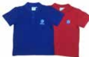
Short-sleeved Polo Shirt