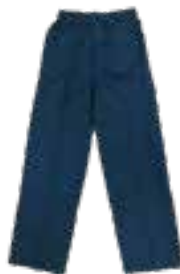
Navy Elastic Waist Pants