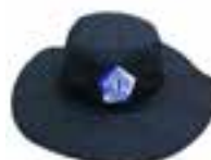
Glenaeon Sun Hat