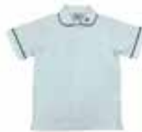
White Blouse Long/Short Sleeved