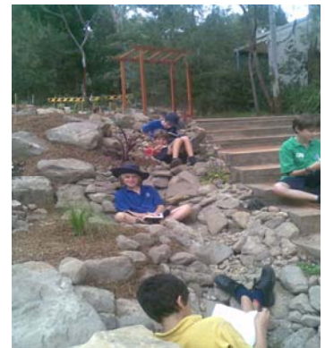
River of boys!